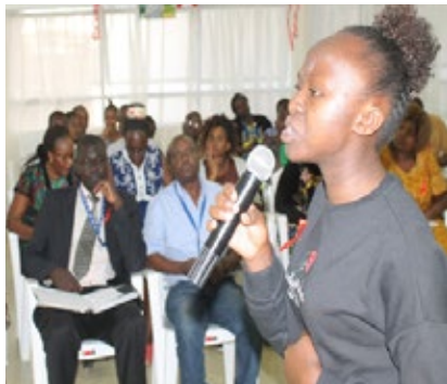
A girl from Mama Ngina Children's Home recites a poem during World Aids Day fete at KLB head quaters.

December 1, every year is the World Aids Day, a day observed to raise awareness about HIV and AIDS and mourn those who have succumbed to the condition. On December 1, 2017, KLB Staff joined the World in marking the 29 th World AIDS Day at the Conference Hall in KLB Headquarters. The theme of the day, 'Step Up HIV: Youth Na Plan', was well communicated through the dress code and the tickertapes on the walls of the hall.