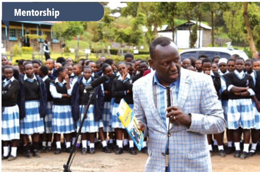
KLB Managing Director addressing Students at Lamudiak Mixed Secondary School in Njoro sub-County.