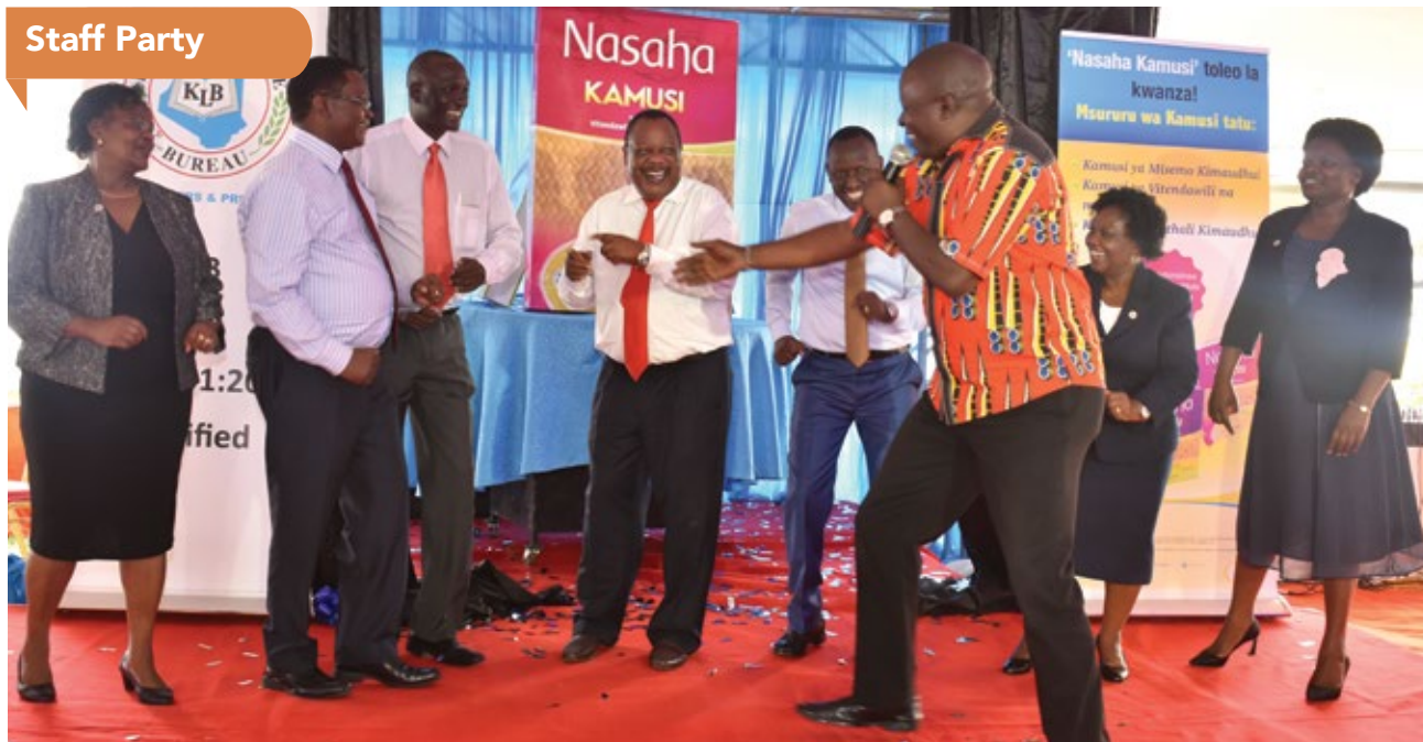
KLB Board Members dance to Kayamba Africa beats during the annual staff end year party at the Buureau's headquarters in South C, Nairobi.