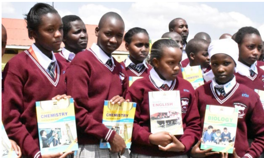
Njoro Girls High School Form One students display copies of Text books received from KLB