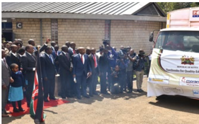
President Uhuru Kenyatta flags off the National Textbook distribution exercise at CEMASTE in Karen, Nairobi on January 5, 2018.