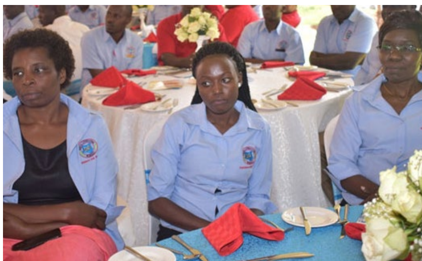
A section of KLB staff follow proceedings during the ISO 9001:2015 QMS certification launch and the unveiling of Nasaha Kamusi series at KLB headquarters in South C, Nairobi.

KLB also took the opportunity to launch three Nasaha ya Kamusi publications; Nasaha Kamusi ya Methali Kimaudhui ,