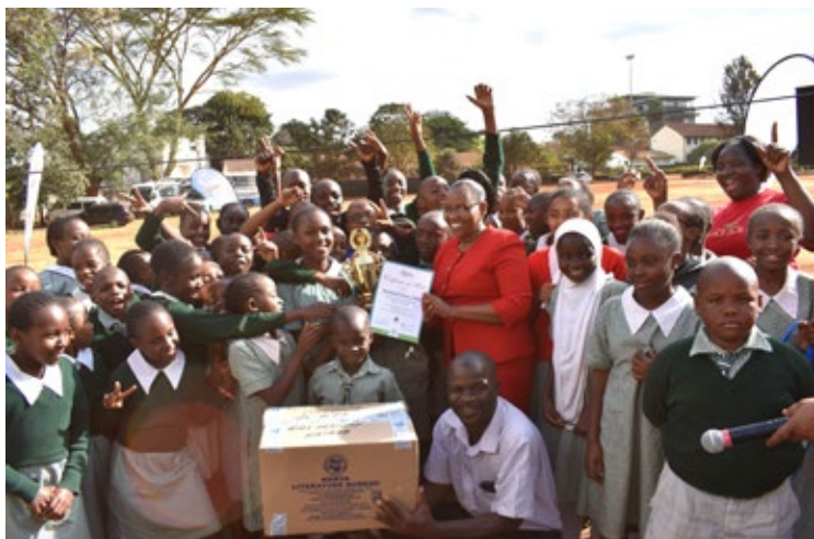
Westlands Primary School, Nairobi pupils celebrate winning the 1st runners up trophy at the NIBF's Children Writing and Art Competition.

to the poor in the society. He called on the Government through the Ministry of Education to review the law and lift it saying it would improve access to knowledge materials.