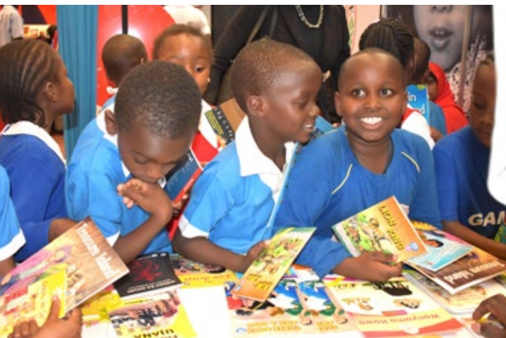
Pupils from various schools in Nairobi sample text books at KLB stand during the 2017 Nairobi International Bookfair at Sarit Centre, Nairobi.