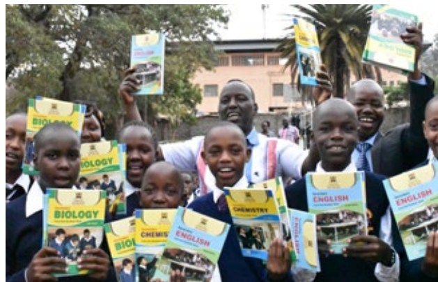
Textbook distribution at Menengai High School, Nakuru