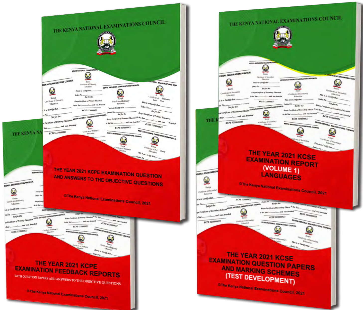
The KCPE and KCSE examination question papers, marking schemes and feedback reports

These books are resourceful to teachers, guiding exam preparation and how to handle questions. They also outline the main challenges candidates face and advance possible reasons for poor performance.