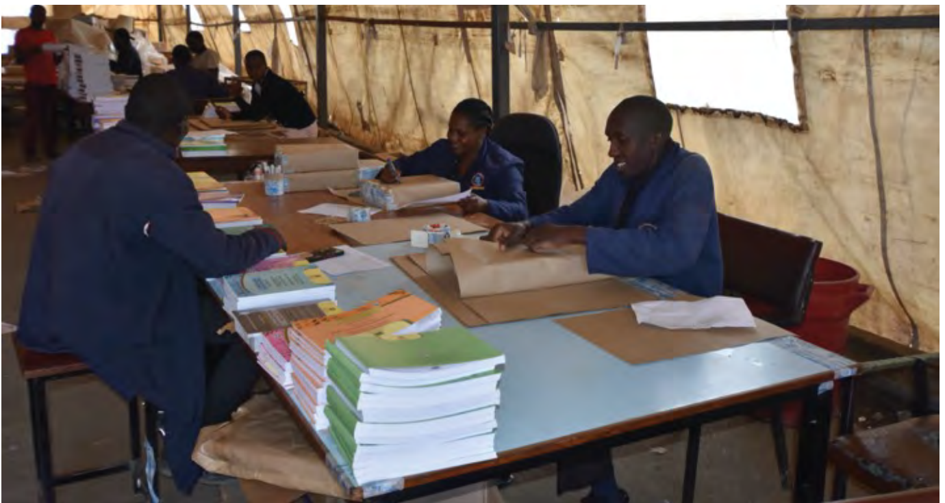
Staff packing books for the bulk season orders

Samaritan, KLB Visionary series, KLB Encyclopaedia, among other titles. The marketing team continues to market the KLB brand in schools aggressively. They call on the rest of the KLB staff to boost their efforts by selling KLB books in schools attended by their children. KLB books remain the most comprehensive school texts across the country.