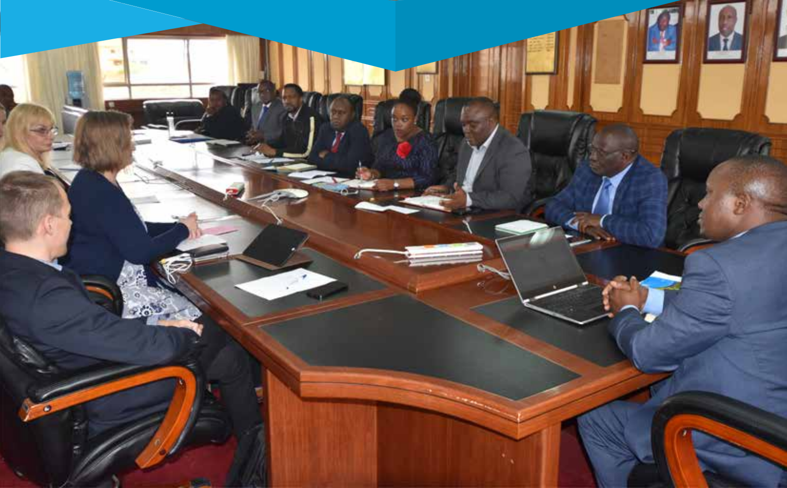
Consultative meeting between KLB and Opiq teams held at KLB headquarters' Board room in November 2022.

select KLB staff members. The training aims to build internal capacity and foster a learning culture for digital book development as the Bureau stays abreast with the rapidly evolving world of technology.